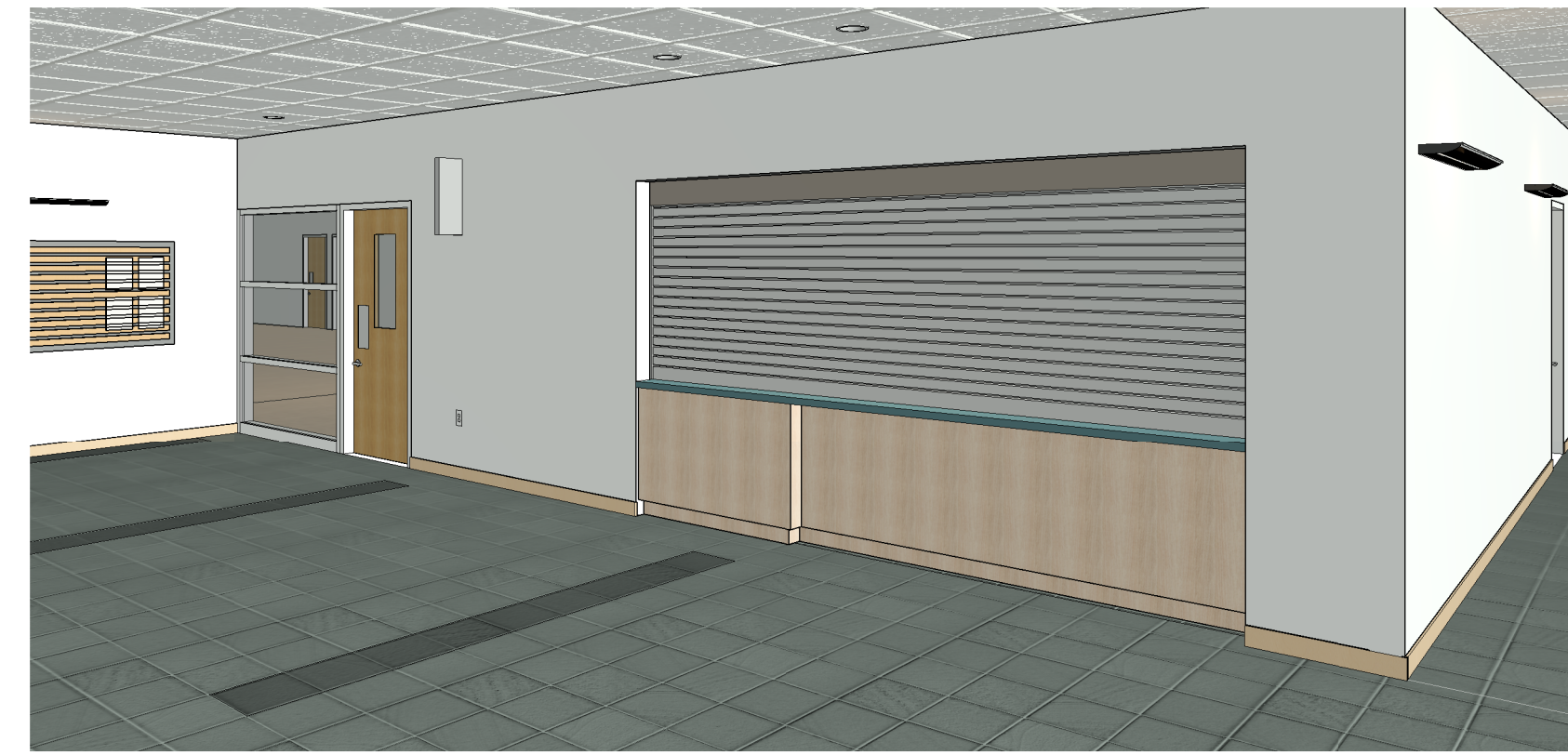
2 3D VIEW FROM LOBBY_CURTAIN CLOSED

SHADED AREA INDICATES UNIT TO BE MODIFIED REPLACE CARPET TILE AND VINYL BASE THROUGH OFFICE