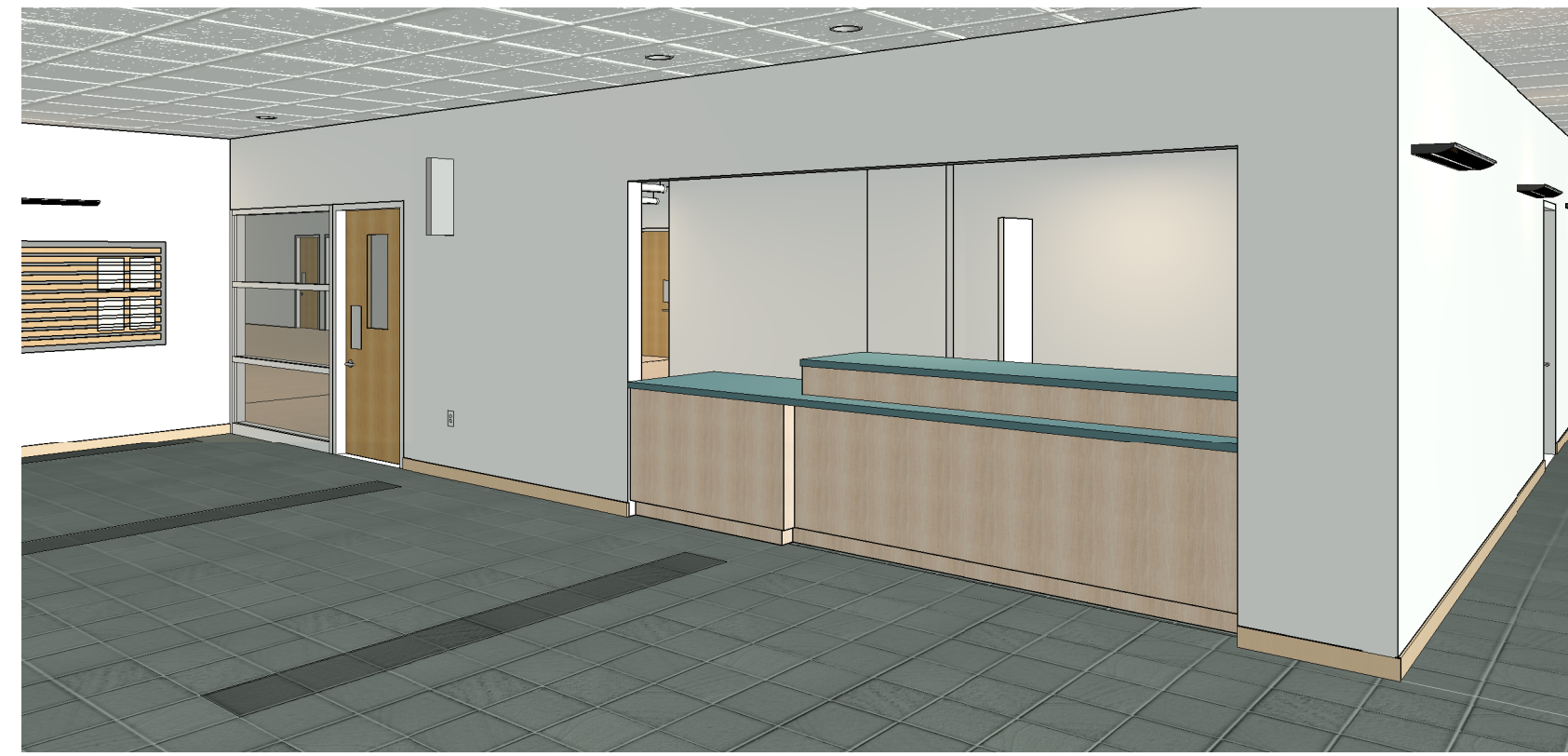
3 3D VIEW FROM LOBBY_CURTAIN OPEN