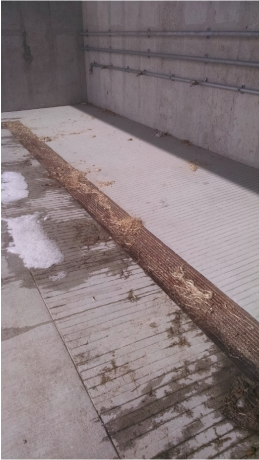
Figure 3. Typical trench drain and concrete finish.