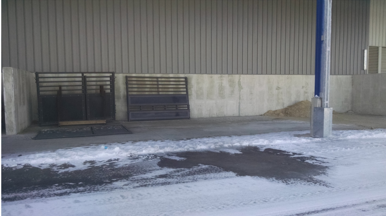
Figure 5. Pavilion #2 wash rack location

The above pictures have been provided for your convenience and should not be viewed as an alternative to the site tour on Tuesday, March 17. In addition the architectural and plumbing plans for the existing wash racks are provided with the enclosed bid documents.