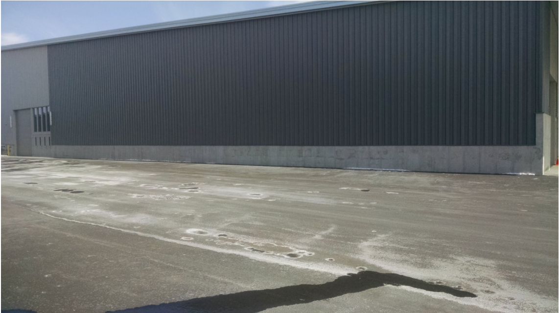
Figure 4. Pavilion #1 wash rack location.