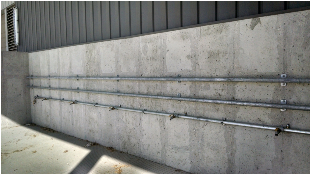
Figure 1. Example double tie livestock wash rack.

This project requires the successful bidder to be responsible for the complete design (all permitting through plan approval) and construction of the livestock wash racks and trench drains. A total of 150' of wash racks will be added to the Alliant Energy Center New Holland Pavilions. Pavilion #1 will have 90' of single tie wash racks on the western end of the building, south of the entrance doors. Pavilion #1's wash rack shall have 15 hose bibs and shall include one 7'9" tall and one 3'9" tall by 10' long fiberglass sheathed metal framed end walls. Both end walls shall be adequately supported. The wash racks for Pavilion #2 will extend 60' from column lines 10 to 12 (between two existing concrete walls), with two tie rails and 10 hose bibs. Both wash racks shall have trench drains running the entire length of the wash rack that drain into the sewer. The wash rack areas shall be a 10' wide concrete slab with a grooved float finish. The new wash racks to be installed will need to match in size and appearance of the existing. Architectural and plumbing drawings for a previous wash rack addition between columns 15 and 16 are included for bidders reference only.