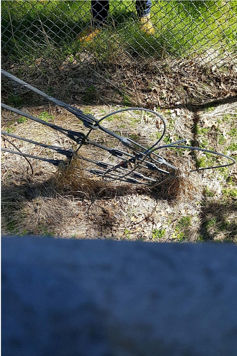
Typical guy wire. Guy wires to be removed flush with the ground surface. Surrounding fencing to be removed.